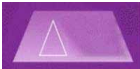
A triangle in Euclidean space (sum of internal angles is 180°)