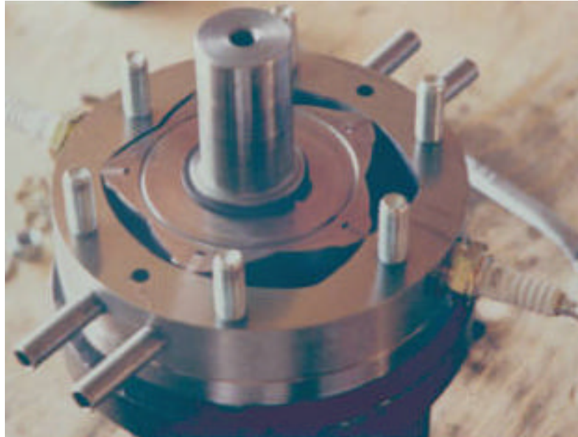
ENGINE PROTOTYPE MADE IN 1988 by Maurice Greenhaugh

The power stroke shown in the sketch draws in fuel to be compressed by the power stroke that takes place after the compression stroke shown at the bottom of the engine. The shown power stroke also forces out the exhaust from the previous explosion and also flushes out the remaining exhaust from the firing before that. The engine completes fifty stroke cycles in every piston revolution. A one tenth revolution does the functions for two future firings plus the clean up strokes for the two previous firings.