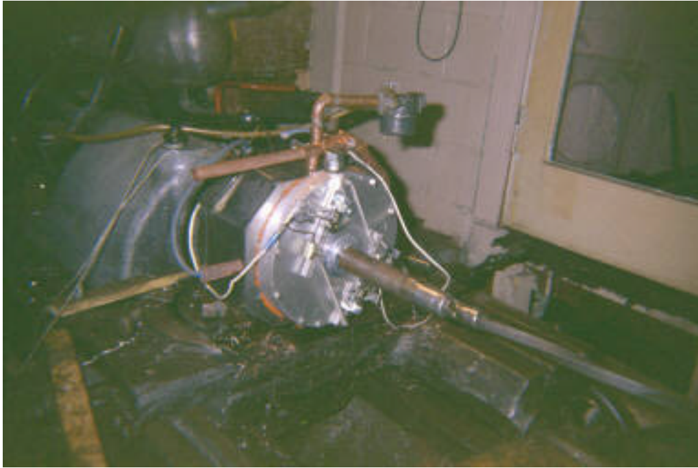
ENGINE BEING TESTED DECEMBER 1999

I want to congratulate the people who have managed to succeed in the development of the wankel rotary engine. They have done the impossible with misinformation and a poor design. The greatest difficulty they solved is the engine only fires in one location causing the chamber on one side to heat up and expand while the other side is cooled by the air fuel intake port. This must tax the designer with sealing difficulties for the rotating piston.