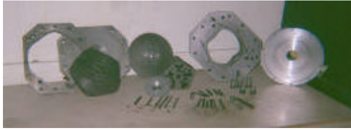
COMPLETE ENGINE DISASSEMBLED